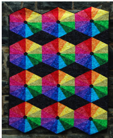
The "Roy Quilt"

Needed: 30 degree ruler/ 60 degree ruler / $10 pattern